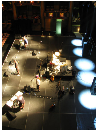
Arena Stage View From USL Spot Position

Check with CCPA Electrics department regarding availability of moving light package