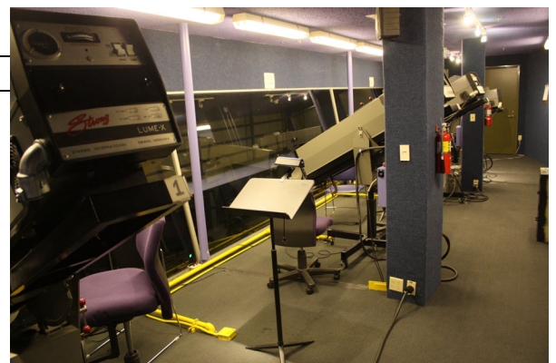
Follow Spot Booth